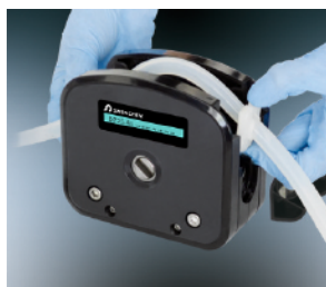
B. Put the tubing with cartridge or connector into pump housing.