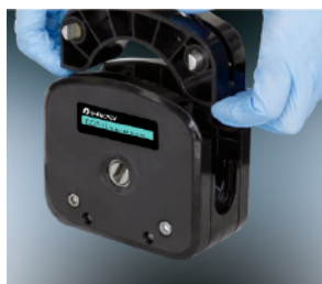
A. Lift both side levers, take off the upper block.