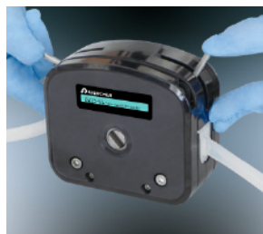
C. Install the upper block, put down the levers to lock the block.